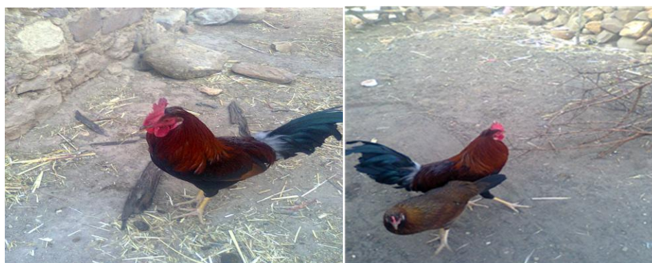
Figure 1: Typical Hemete male (left), female and male (right) chicken ecotype

the birds have white skin color, 30% single combs, 30% rose combs while 100% had plain headed facial appearance (Table 1 and Figure 1). The other peculiar features of this ecotype are good productive and reproductive performance, tolerance to common diseases and have better in egg production.